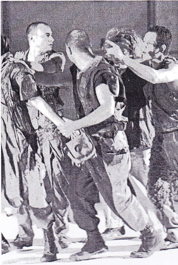
Fig. 3. Group of Soldiers.

Reproduced with the permission of the Ruth Kanner Theater Group.